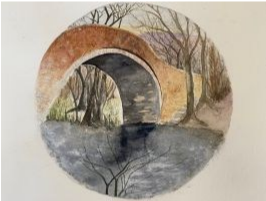
Bridge in Yorkshire - Alison, Watercolour.