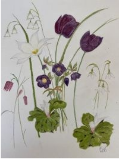
Spring Flowers - Pauline , watercolour.