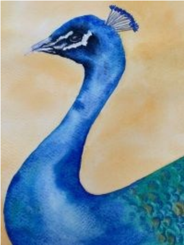
Beautiful Peacock - Edwina , watercolour.