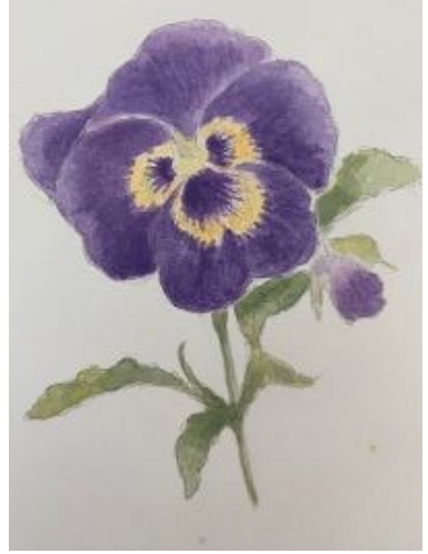
Pansy - Christina , watercolour pencils.