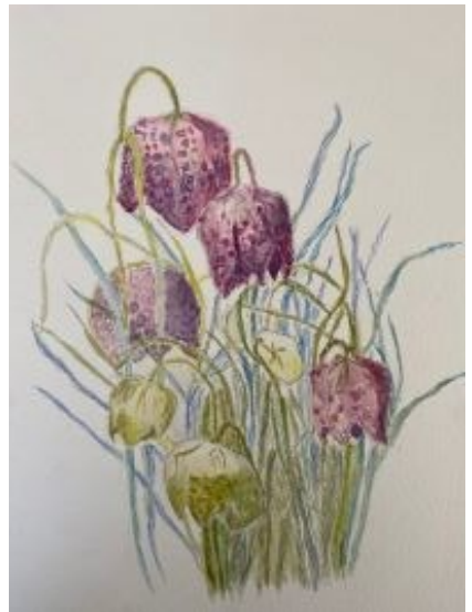
Fritillaria - Carol, watercolour